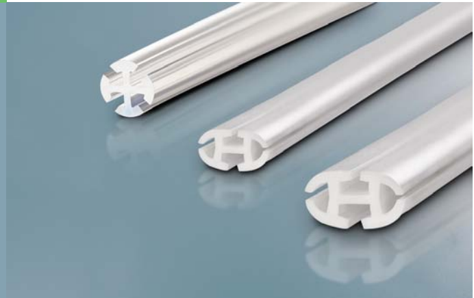
SecuroPlus fluted low-vacuum drainage

The drainage tubing is constructed with four lateral channels to increase drainage efficiency. Tissue friendly silicone material and specific construction provide reliable drainage flow even when single channels are obstructed.